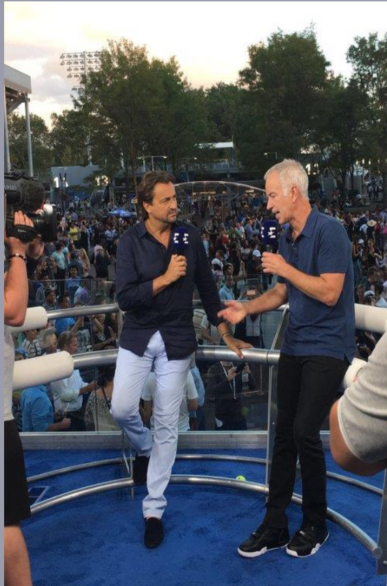
US Open with John McEnroe

Now he presents the backstages of the Grand Slam Tournaments thanks to new tv reports :