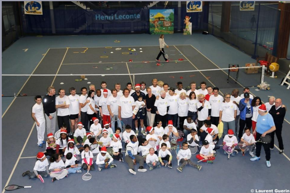
Sourire Gagnant au LSCT