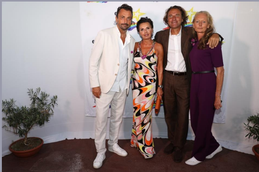
Gala Enfant Star et Match à Monaco